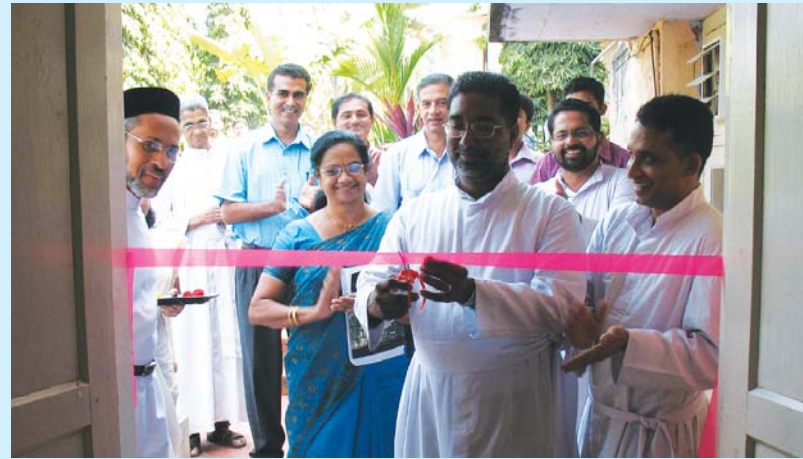
Inauguration of William Memmorial Resource Centre